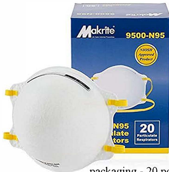
packaging - 20 pcs in a box.